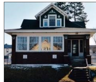
821 W. Locust St., Davenport