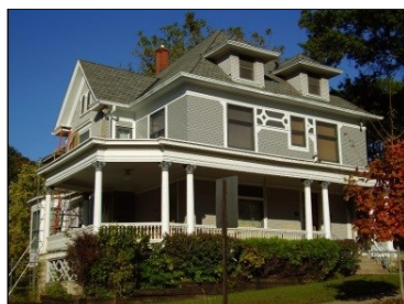
812 Bridge Ave., Davenport