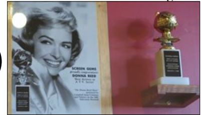
Donna Reed was born Donnabelle Mullenger on a farm outside of Denison

We Celebrated "It's a Wonderful Life Being A Quester" in Denison in October and a wonderful time was had by all.