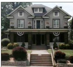
2326 Harrison St., Davenport